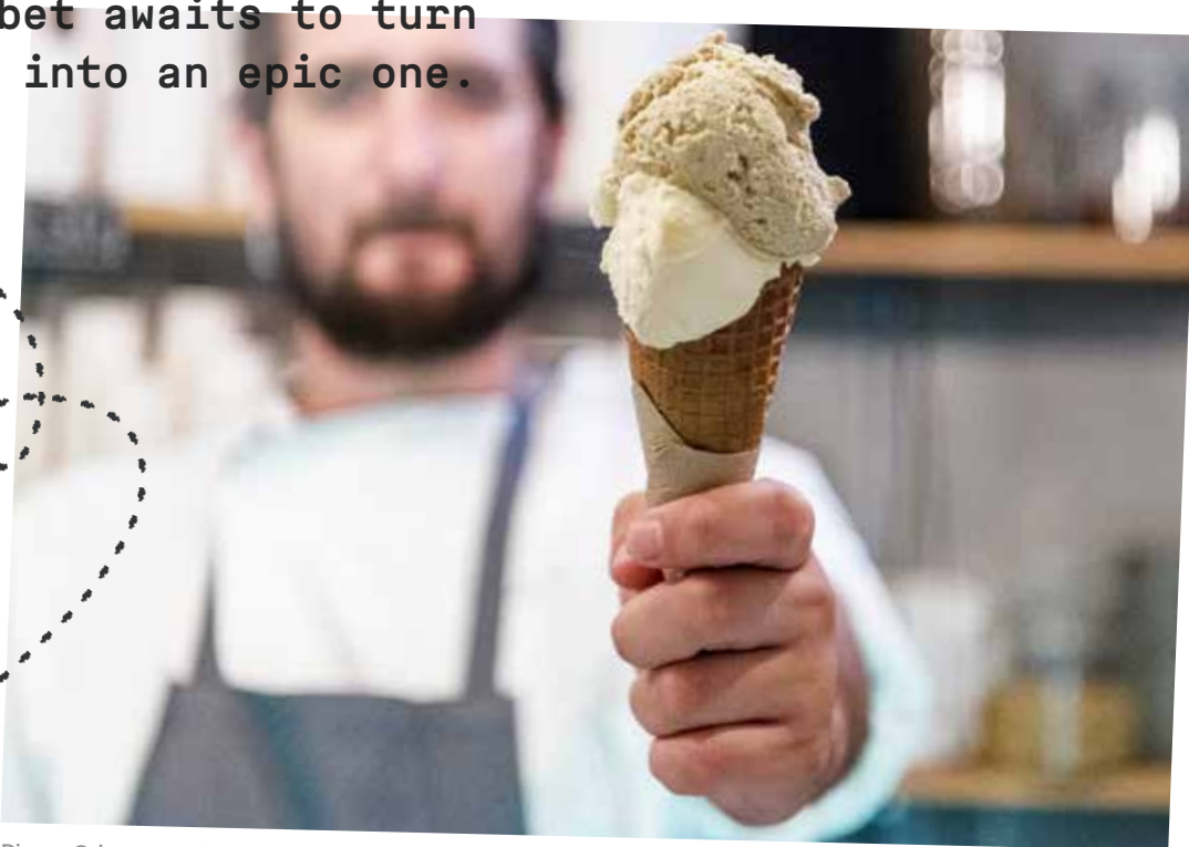
Django Gelato opened its first store in 2005 at the Cycladic island, Syros. In 2021, it opened a second store in Koukaki, Athens!

Next stop: the Acropolis. Get ready to be dazzled by ancient marvels like the Temple of Athena Nike and the Parthenon. These spots are more than just a history lesson; they're your ticket to walking in the footsteps of legends.